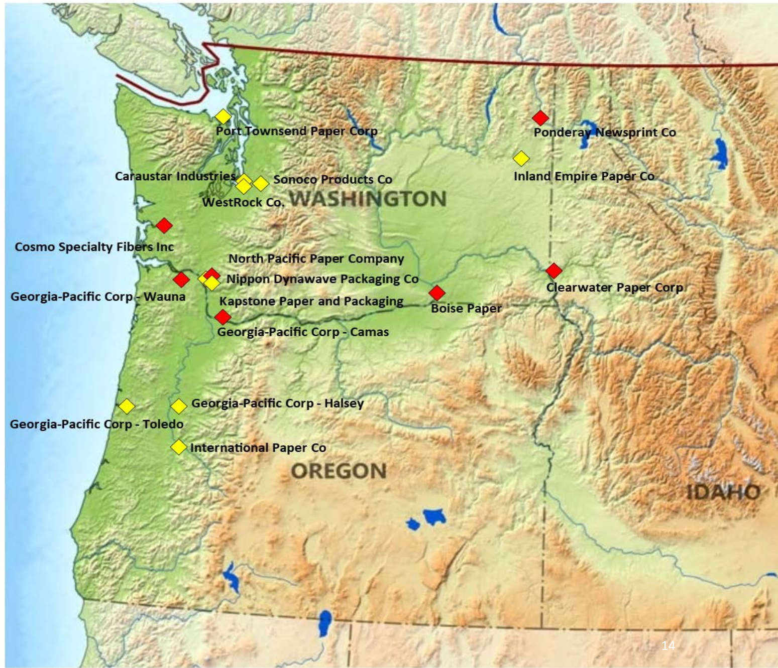
Map of Paper Mills in WA and OR State (2018)